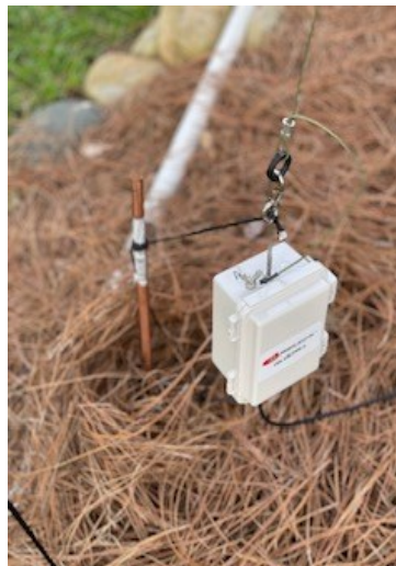
Radials, not visible here, were buried under the pine straw.