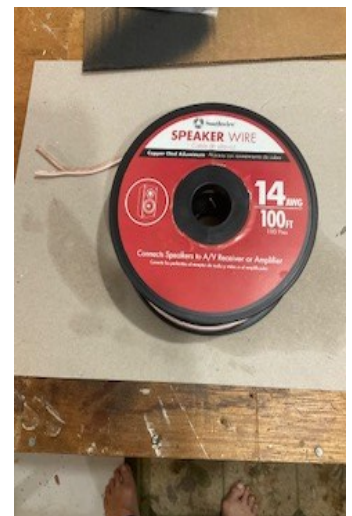
Wire used for radials, purchased at Lowes.