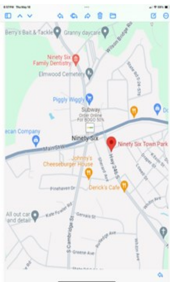
Map provided by Di, N4DLL

The summer Field Day was discussed, it will be 22-23 June this year. The theme this year is “Be Radio Active.” Dave KY4GM has received approval with the town of 96 for use of the city park on both days. (see map below) Kevan N4XL discussed operating the station for 24 hours. Set up will be the morning of the 22nd then 24 hr operation through morning of the 23. Bring your own food/water. “Field Day is officially an operating event not a contest. Its purpose is to demonstrate the communications ability of the amateur radio community in simulated emergency situations for as long as necessary.” It will be further discussed at the 06-11 monthly meeting.