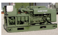
10 x 10