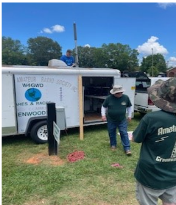
Found time to work on the club trailer