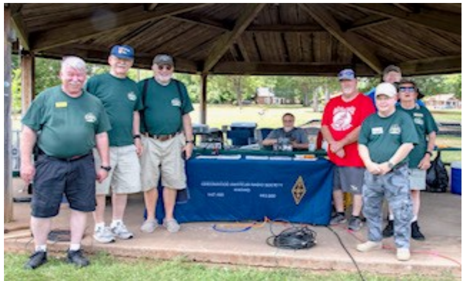
The man in red is the ninety-six Major who stopped in to say Hi.