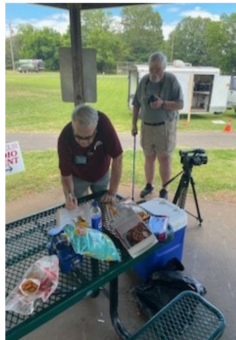
2 ARRL representatives signing in